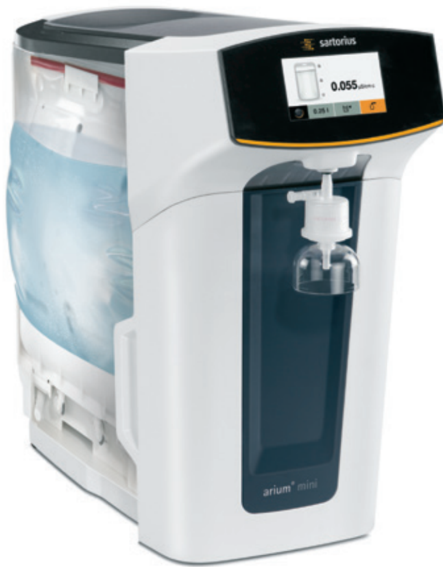
Exemplary representation with open side cover

arium® mini – unique quality “Made in Germany”